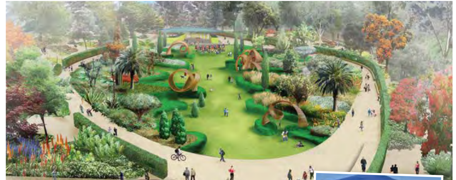
Artist Impression - TCL